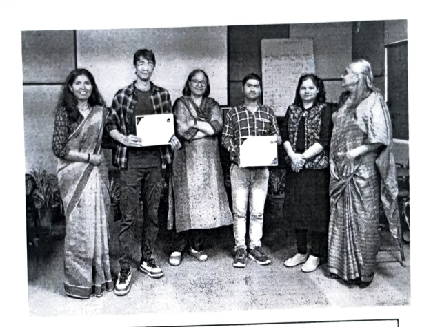
SECOND RUNNER-UP, AMALGAM-2024