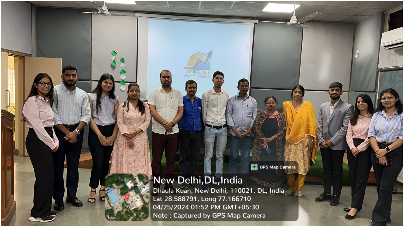
Core Team with Faculty