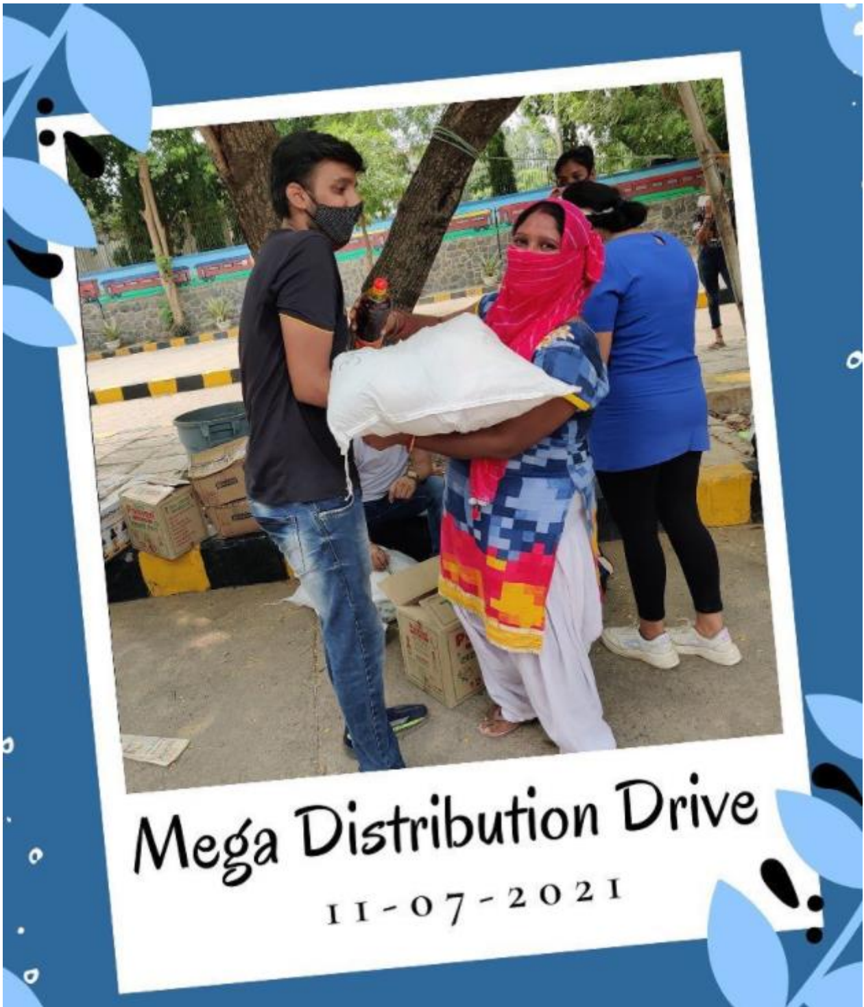
Glimpse of the distribution drive