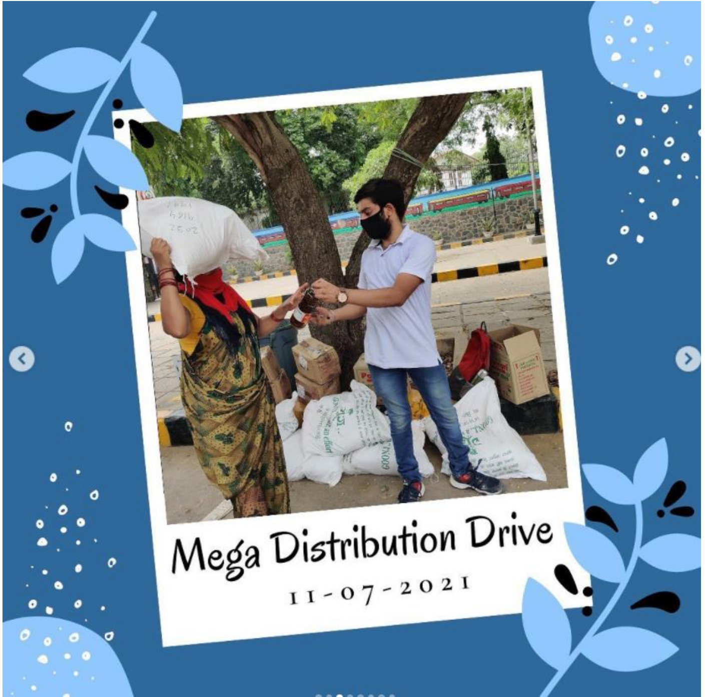
Our volunteers assisting in the distribution drive