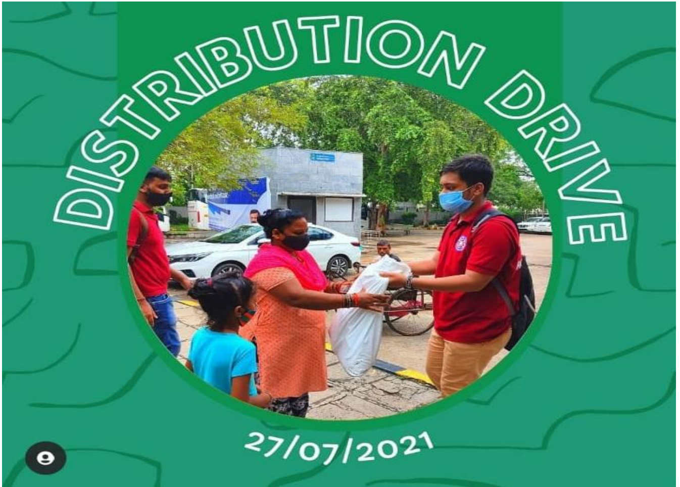
Distributing Ration kits to Sanjay camp families