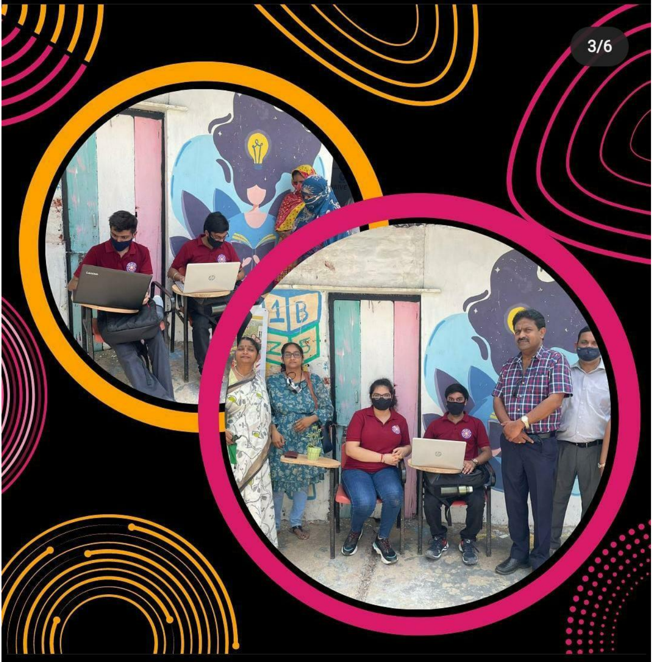
Surveys being conducted days before vaccination camp and data collected accordingly