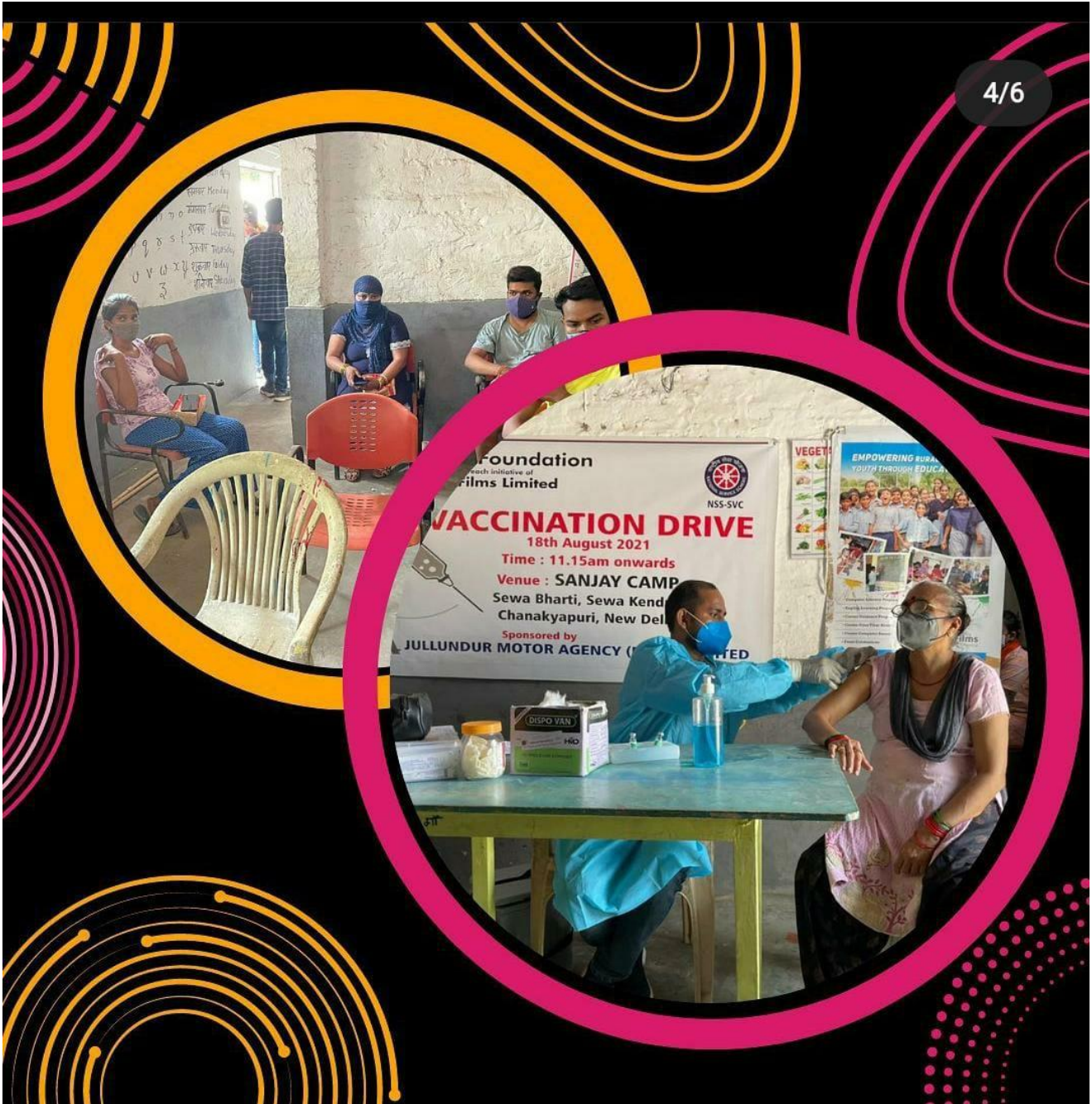
Allotted people given vaccination doses with all covid protocols