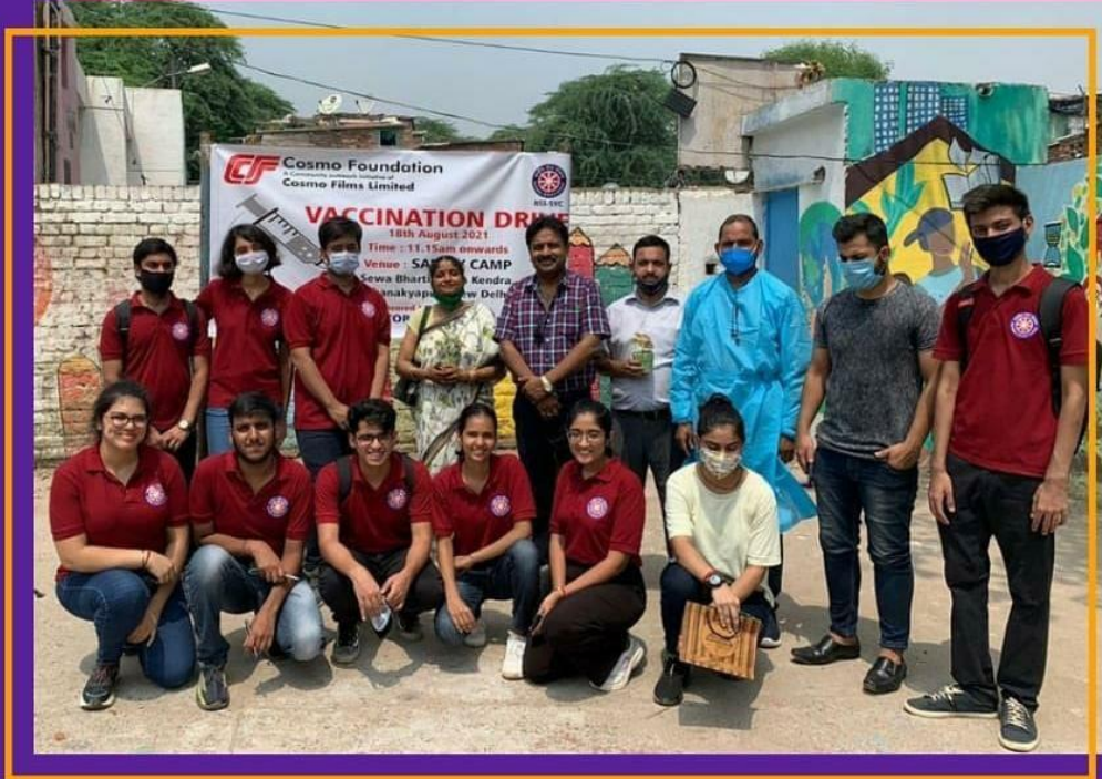
NSS SVC Team at Sewa Bharti Kendra, Chanakyapuri