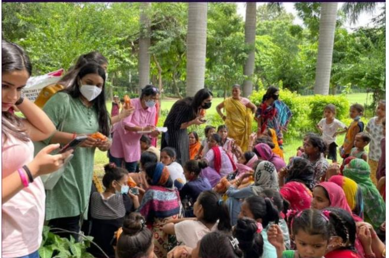
Our volunteers interaction with the women in order to understand the problems being faced by them