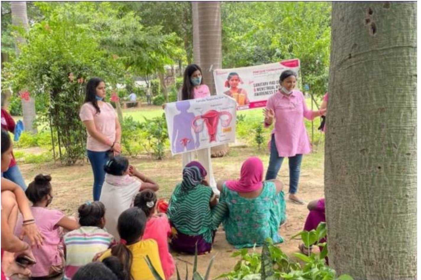
Talk on menstrual hygiene