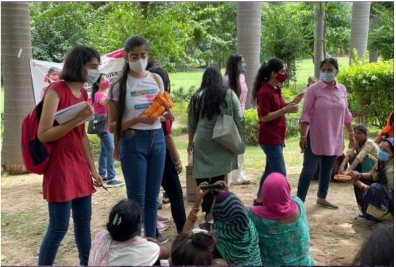
Pad distribution in collaboration with NGO Pinkishe