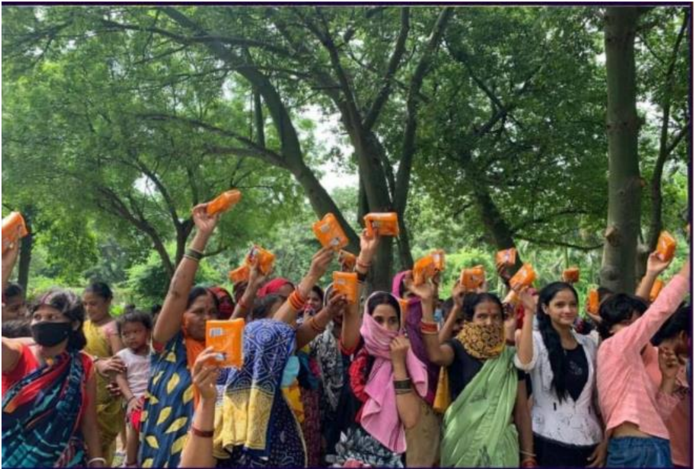
Pad Distribution Drive