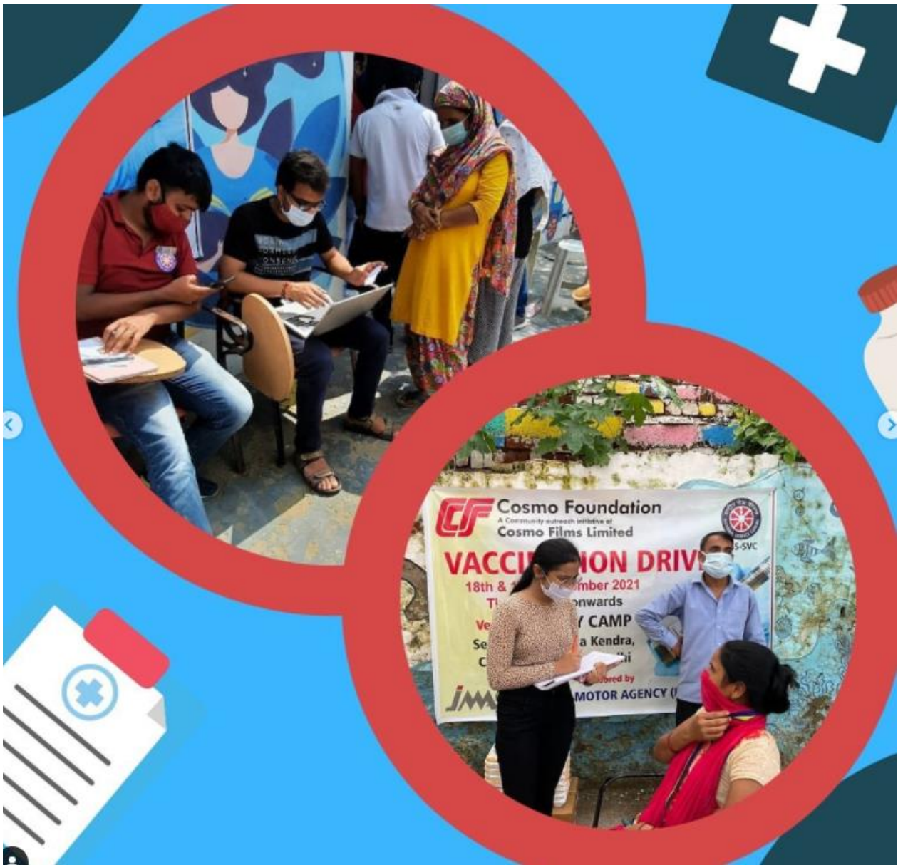
Our volunteers helping with vaccination registration