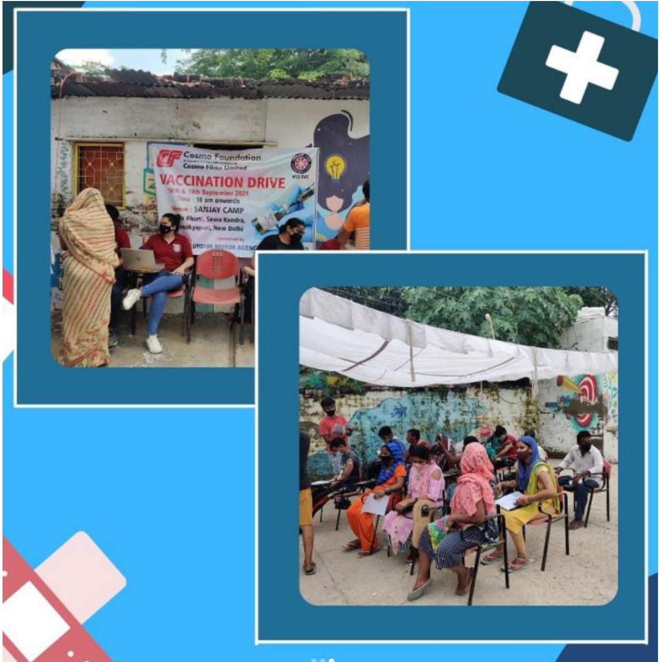
Pictures showing people attending the vaccination camp. We vaccinated about 400 people in a span of two days with the help of about 40 NSS volunteers from our college.