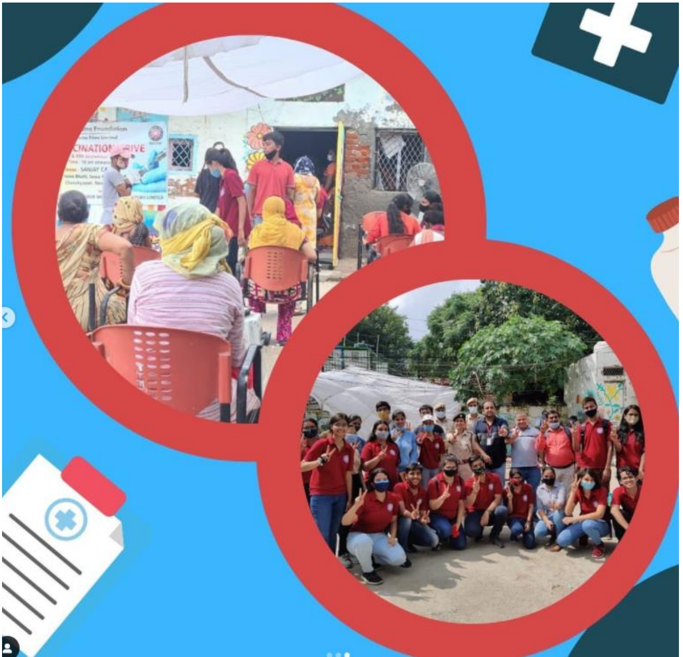
The second edition of our vaccination camp for the people of Sanjay camp