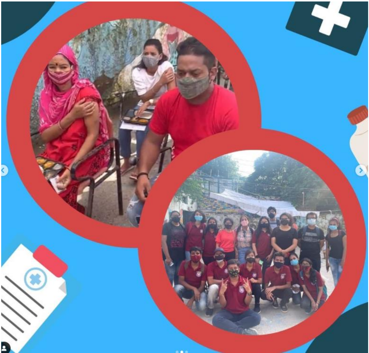
Our volunteers and beneficiaries along with NGO Cosmo foundation