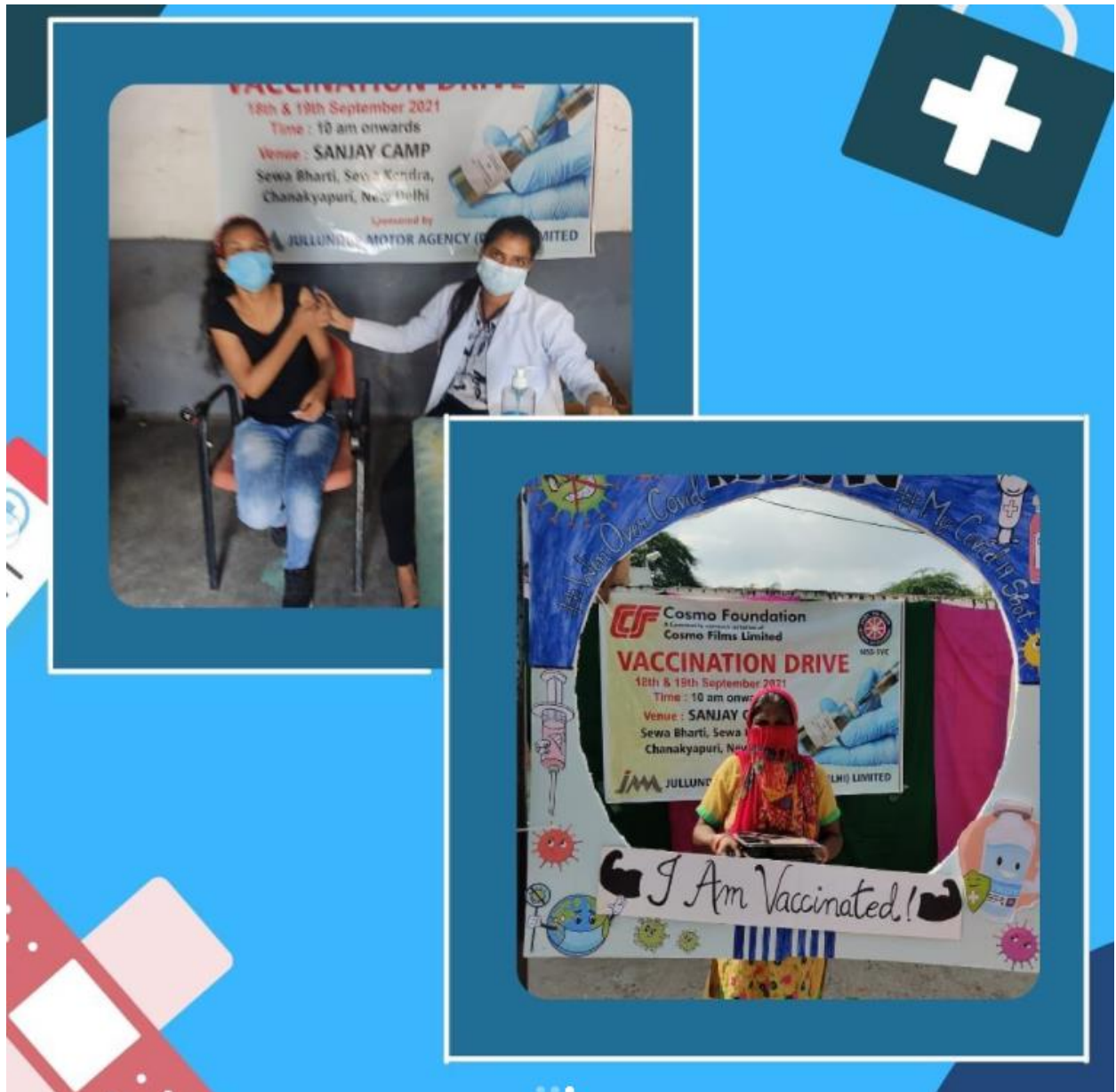
People of Sanjay camp received their first or second dose of the vaccine