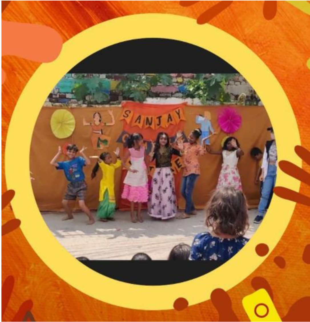
Talent show organized at Sanjay camp