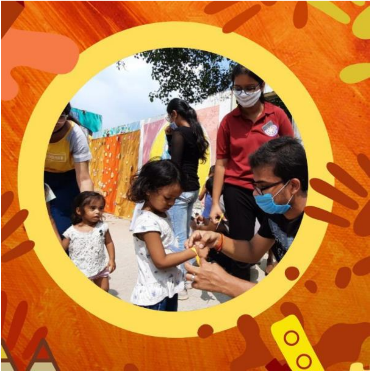
Participation from students of all ages