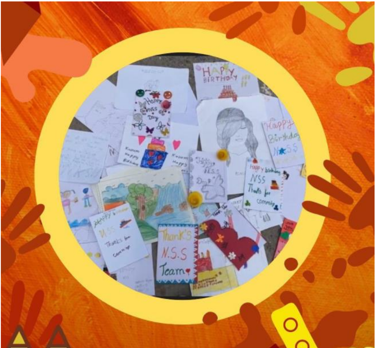
Artwork by Sanjay Camp students