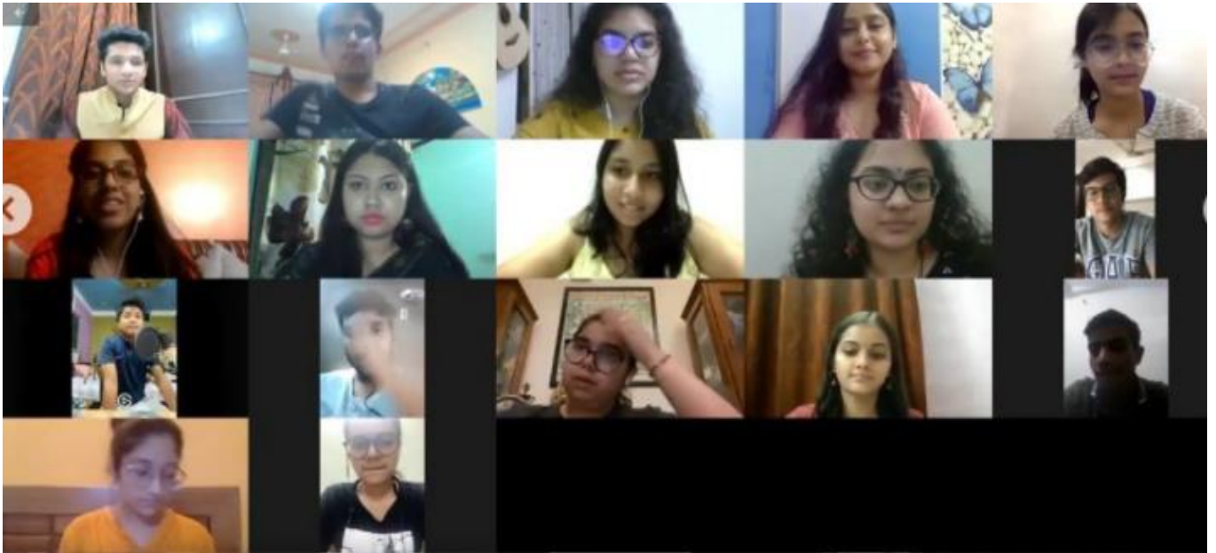
Our volunteers on cultural night