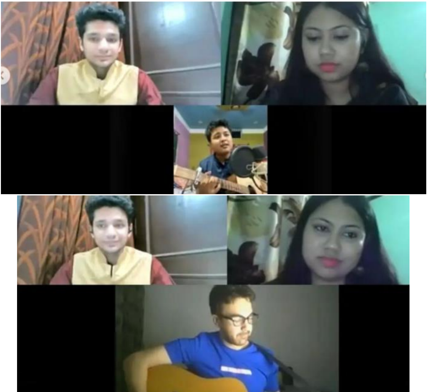
Glimpses of some performances