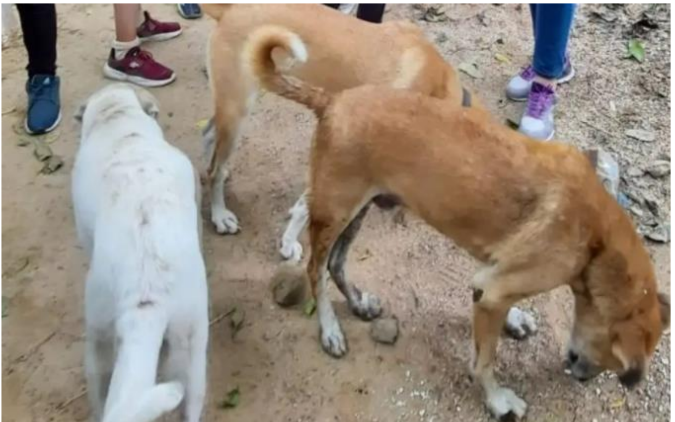
Feeding the dogs of Sanjay Van responsibly