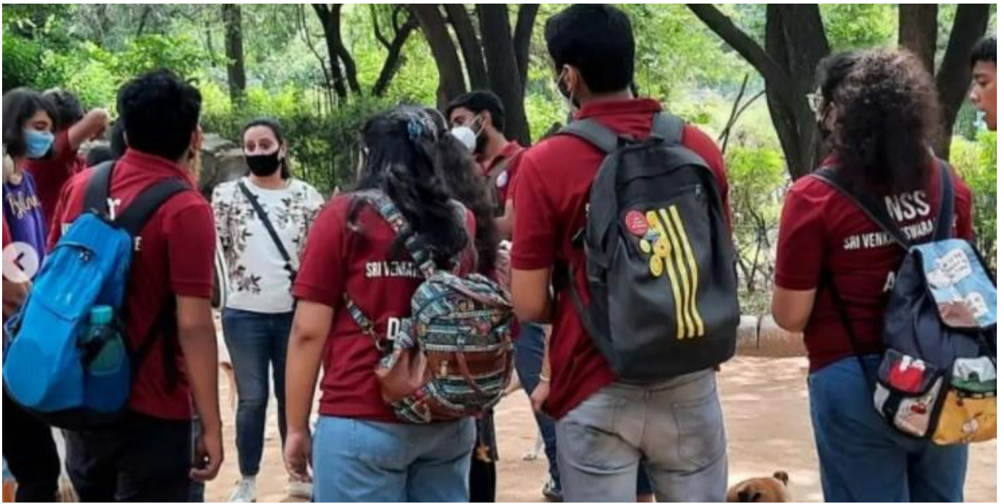
The NGO taught students how to feed dogs and other animals responsibly