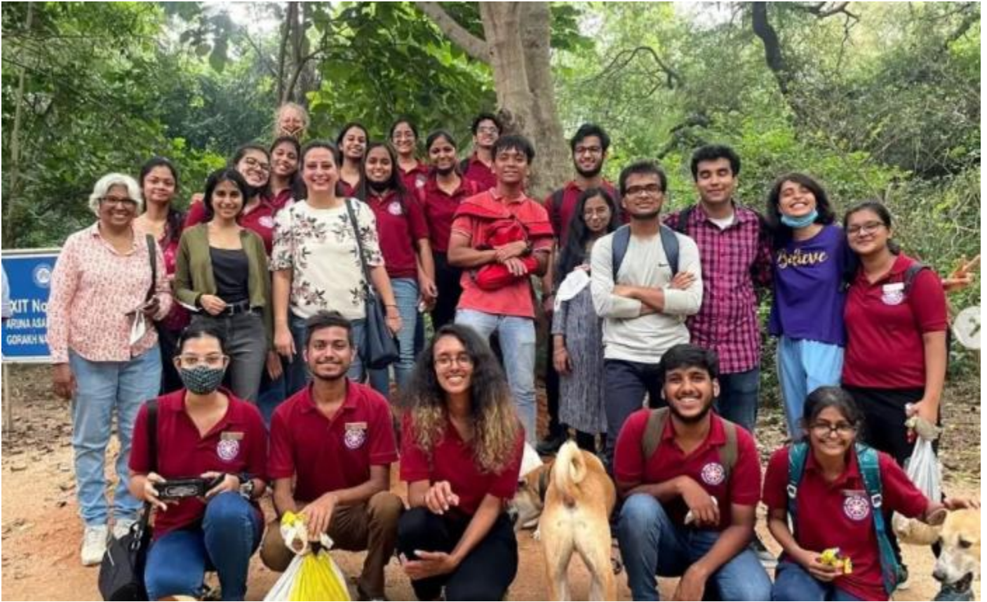
Team of volunteers at Sanjay Van