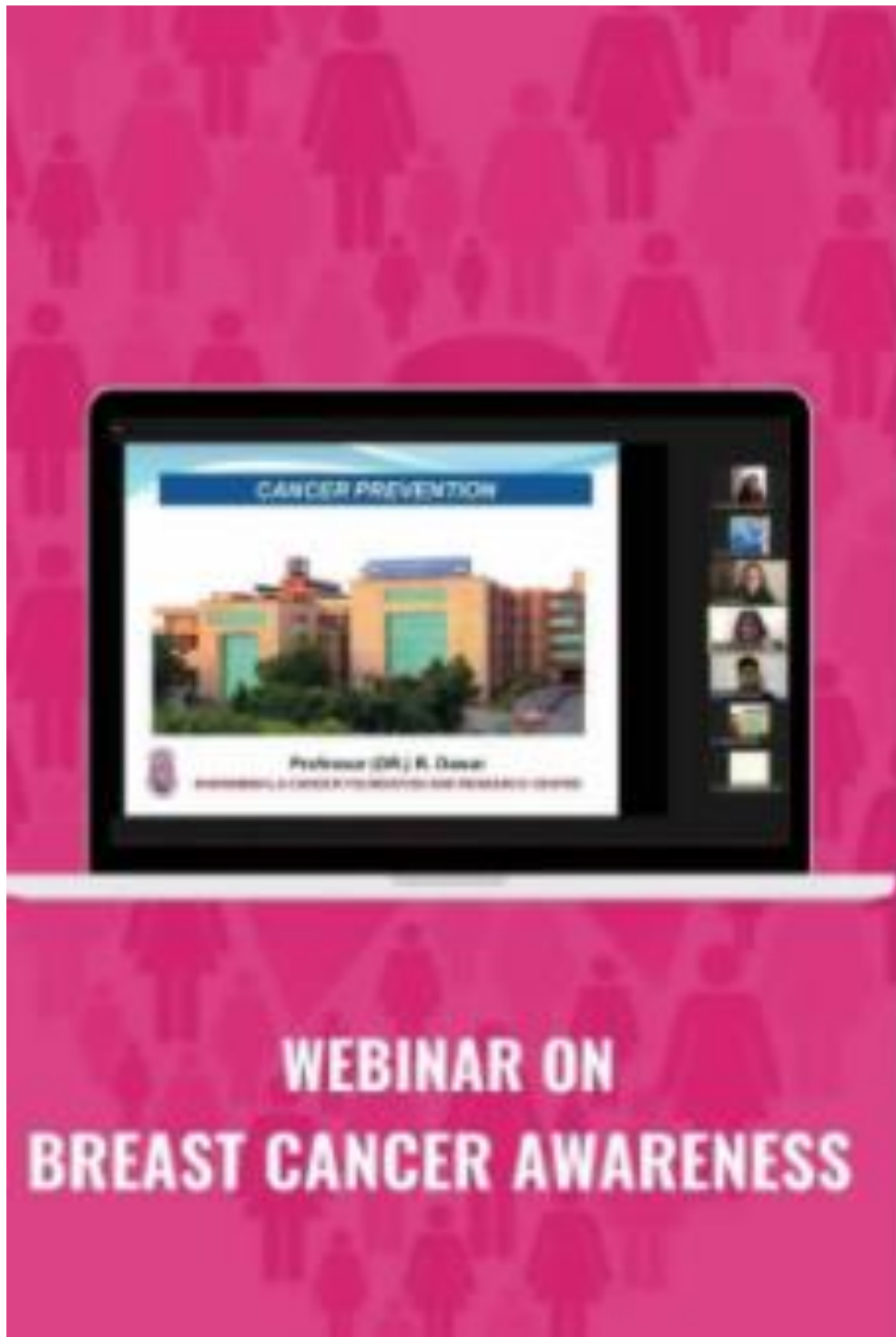
Glimpse from the webinar