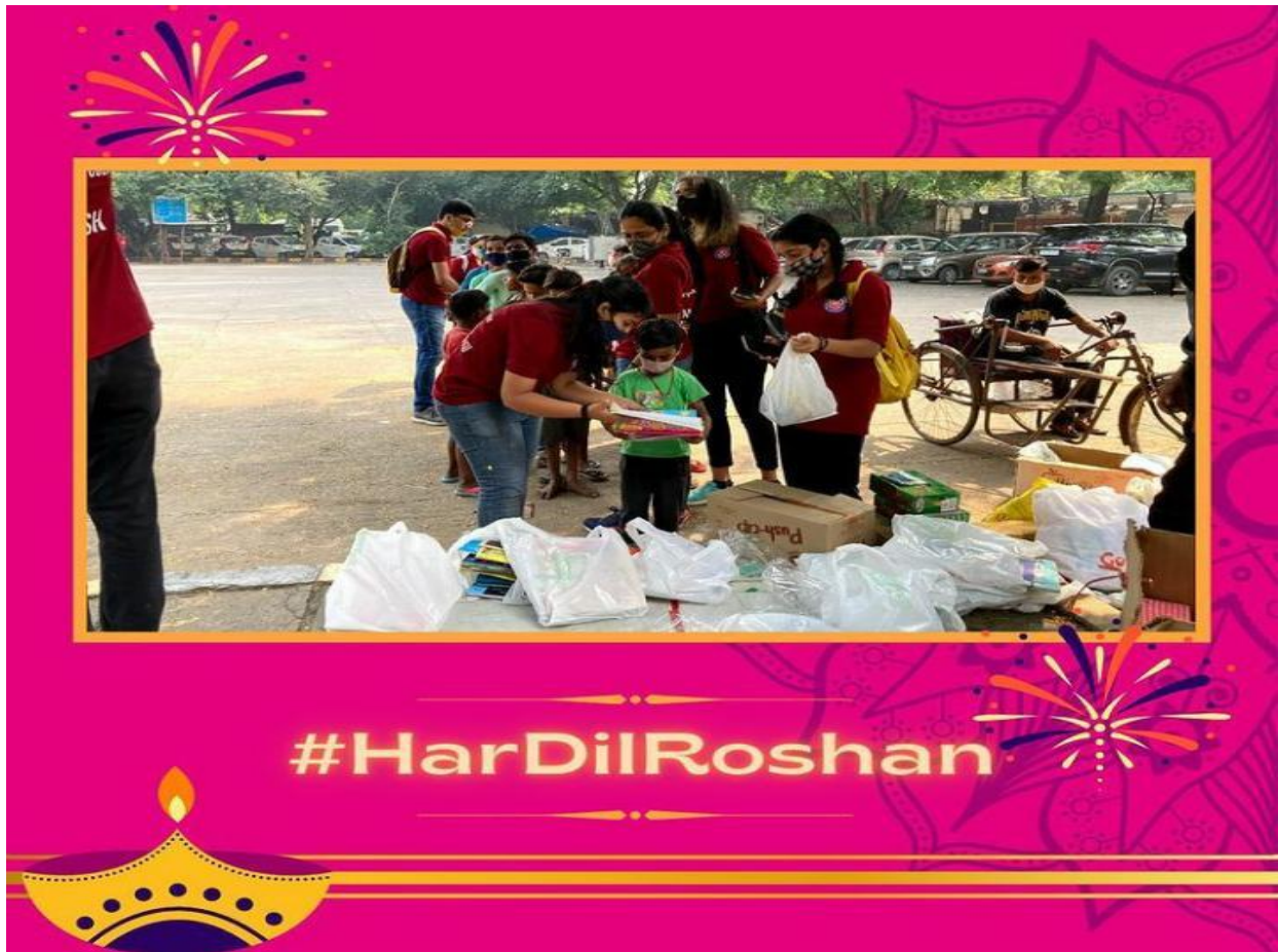
VOLUNTEERS DISTRIBUTING KITS AMONG SANJAY CAMP CHILDREN.