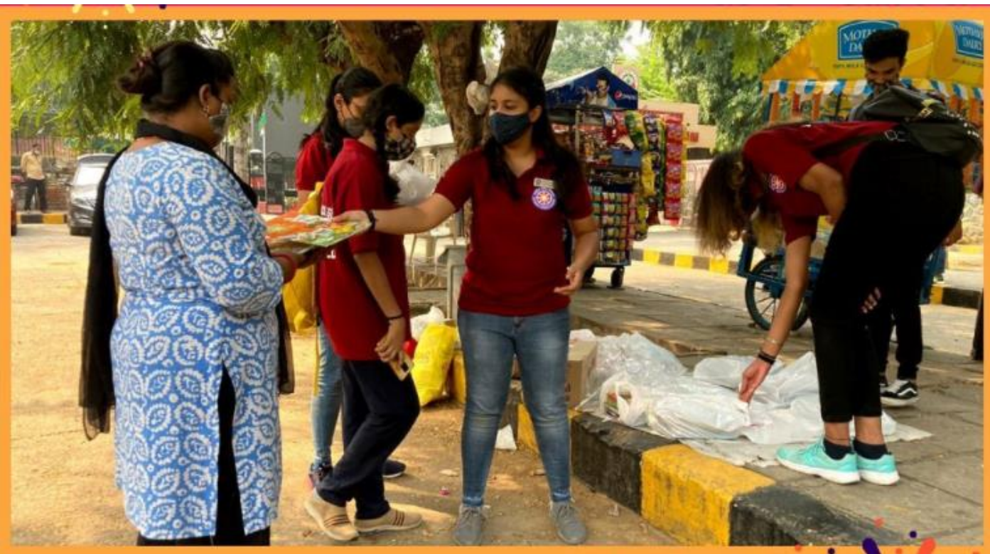
Our volunteers participating in the distribution drive