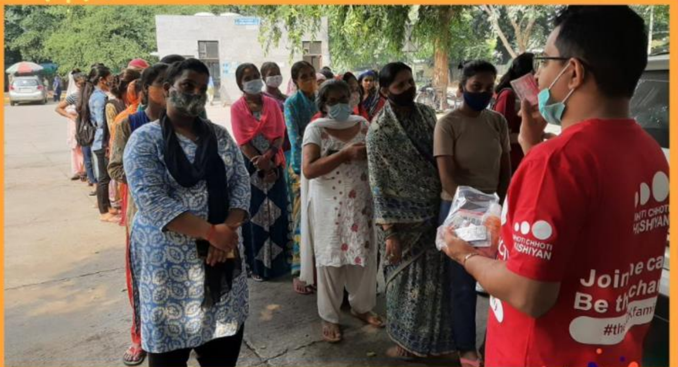
NGO Choti Choti Khushiyan interacting with the beneficiaries