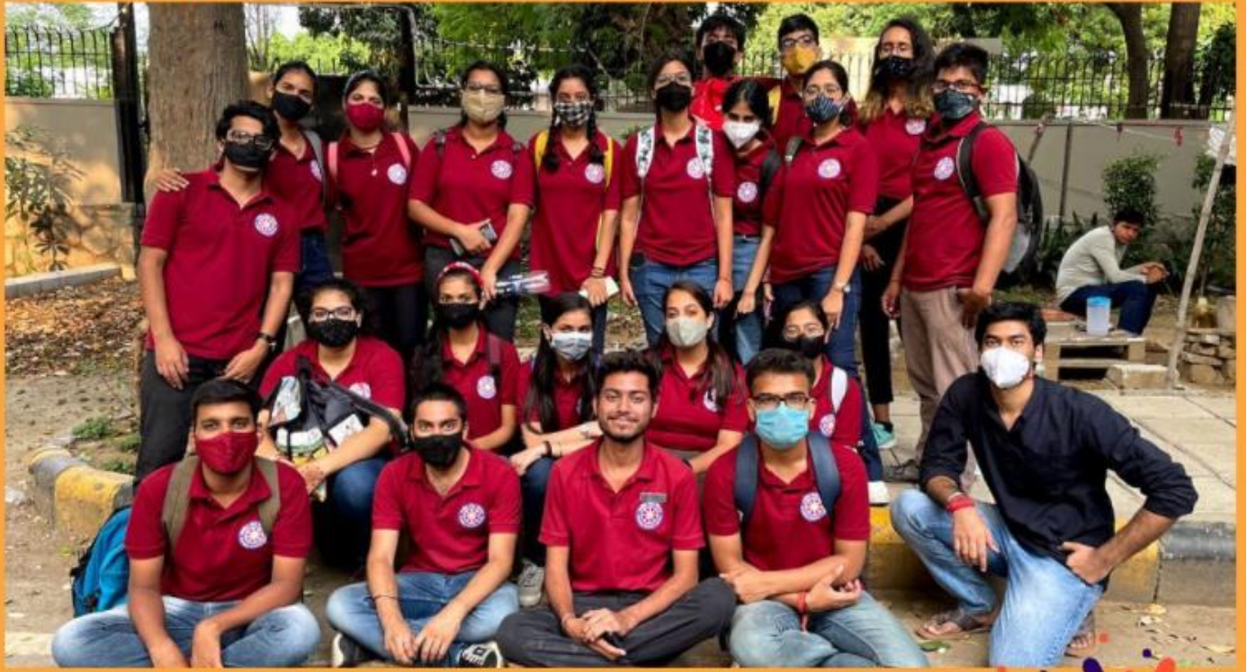
Volunteers at the site of the distribution drive- near Sanjay Camp