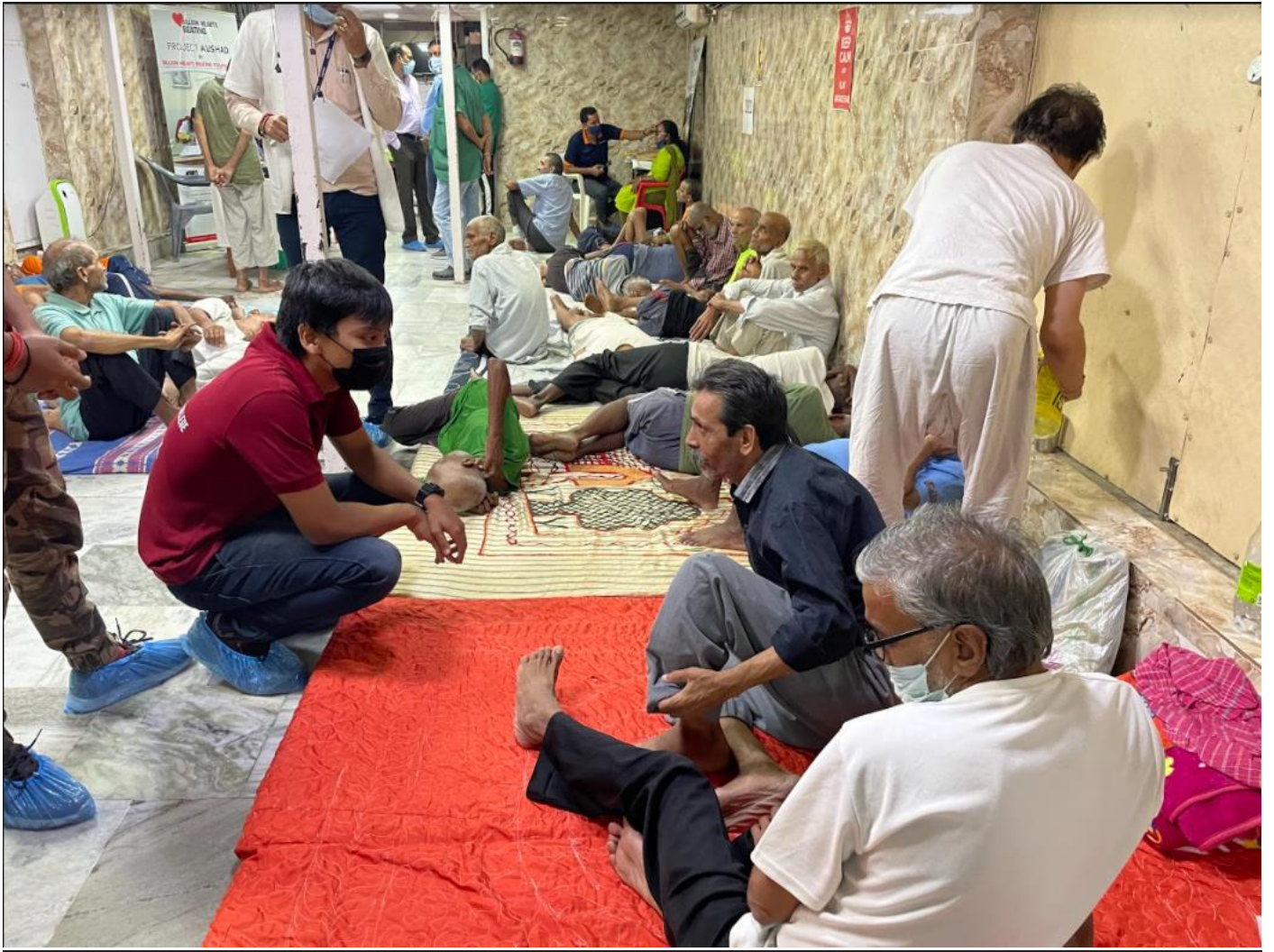
Glimpses from the old age home visit