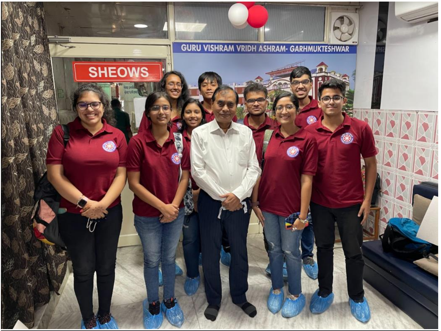
Our volunteers with the benefactor of the old age home