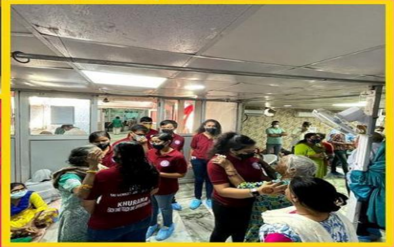
VOLUNTEERS INTERACTING WITH THE PEOPLE AT TAU DEVI LAL OLD AGE HOME.