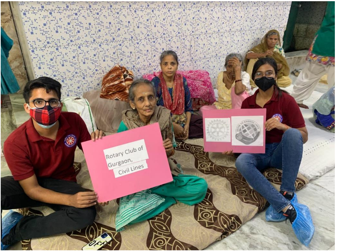
Our volunteers spent time with the people at the old age home