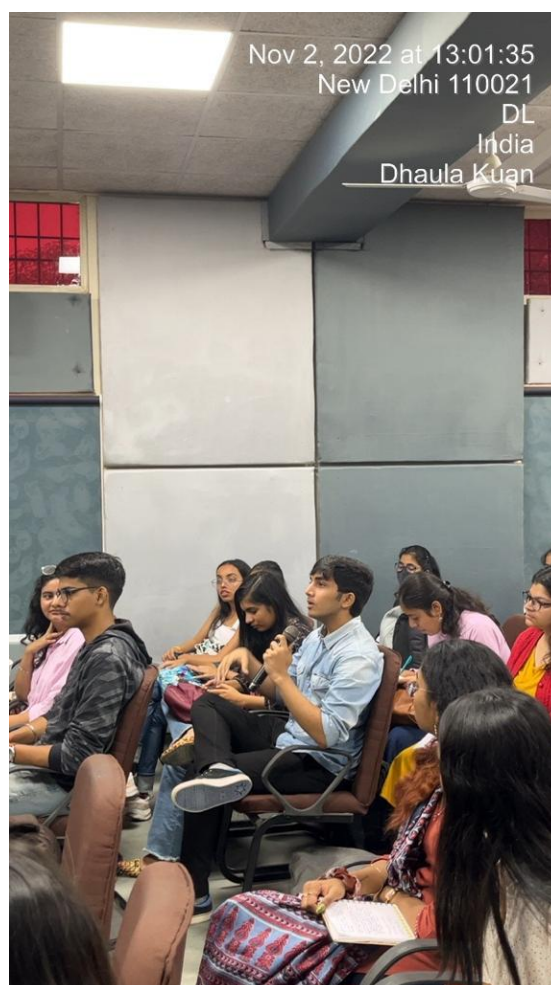
Audience of the event