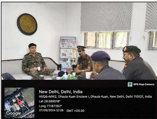
Meeting with the Principal