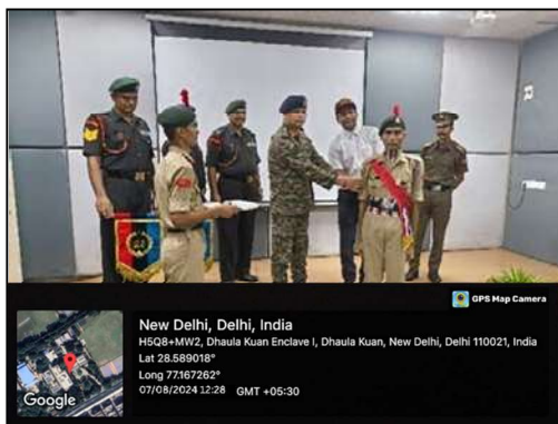
Felicitations of Cadets

The highlighted point of the ceremony was the promotion of cadets. Commanding Officer Sir announced the new ranks, and cadets stepped forward to receive their insignia. The room echoed with applause, celebrating their dedication and accomplishments.