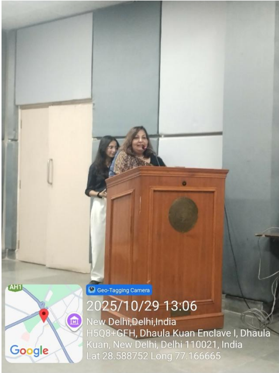
Esteemed Speaker engaging the audience with valuable insights