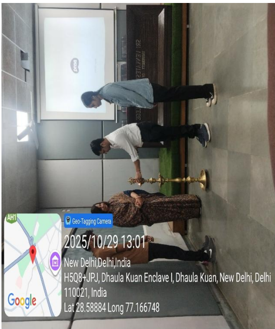
Speaker inaugurating the session with the traditional lamp lighting ceremony.