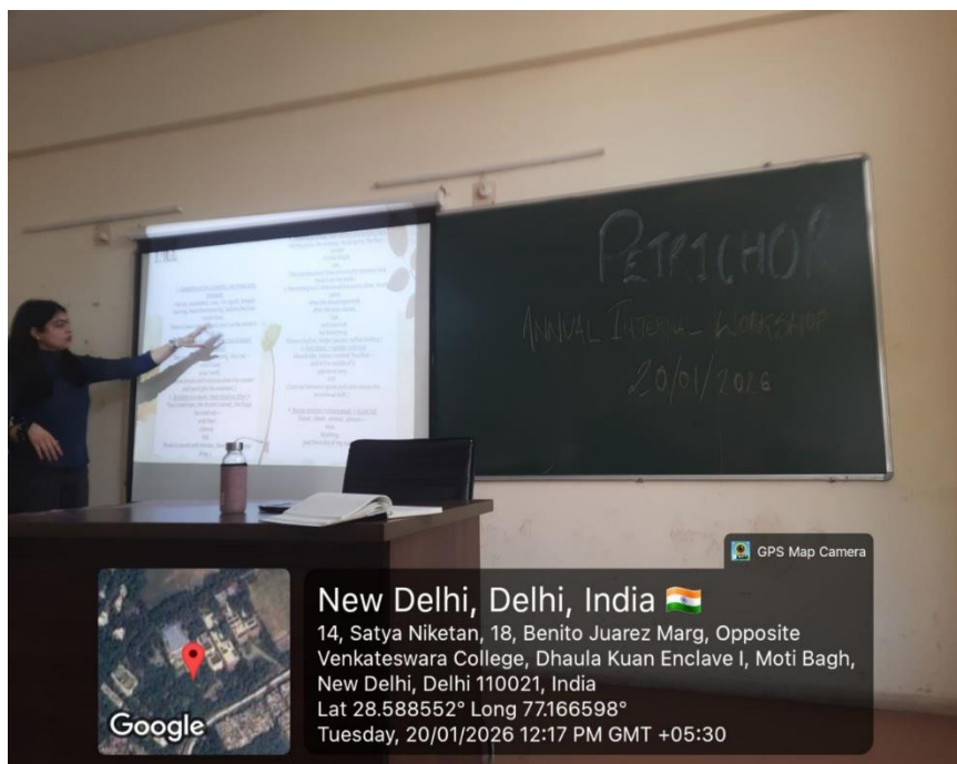
Image 2. Session on English Performance and Writing conducted by Puneeta Chhabra.