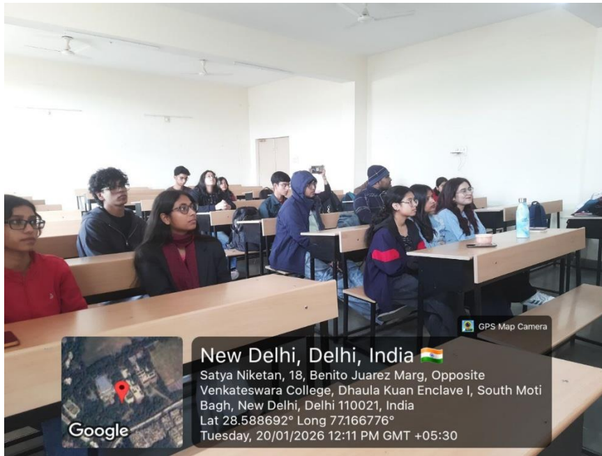
Image 1. Members of Petrichor actively attending the Annual Internal Workshop.