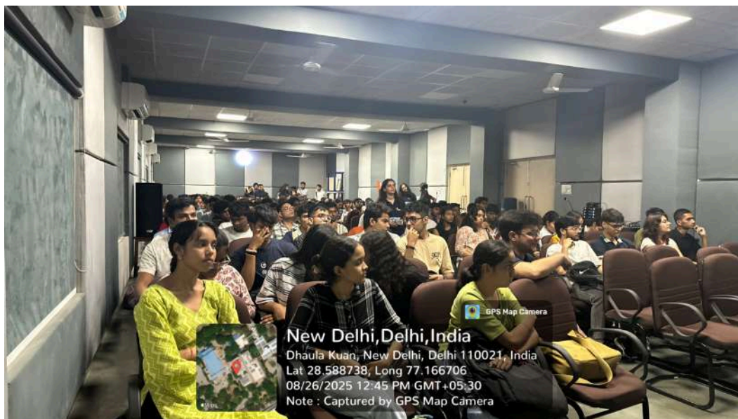
Participants being introduced to various departments and projects at Enactus.

Showcasing Opportunities: Attendees were informed of the diverse opportunities offered by Enactus SVC for developing skills, cultivating leadership abilities, and making a positive impact on the community.