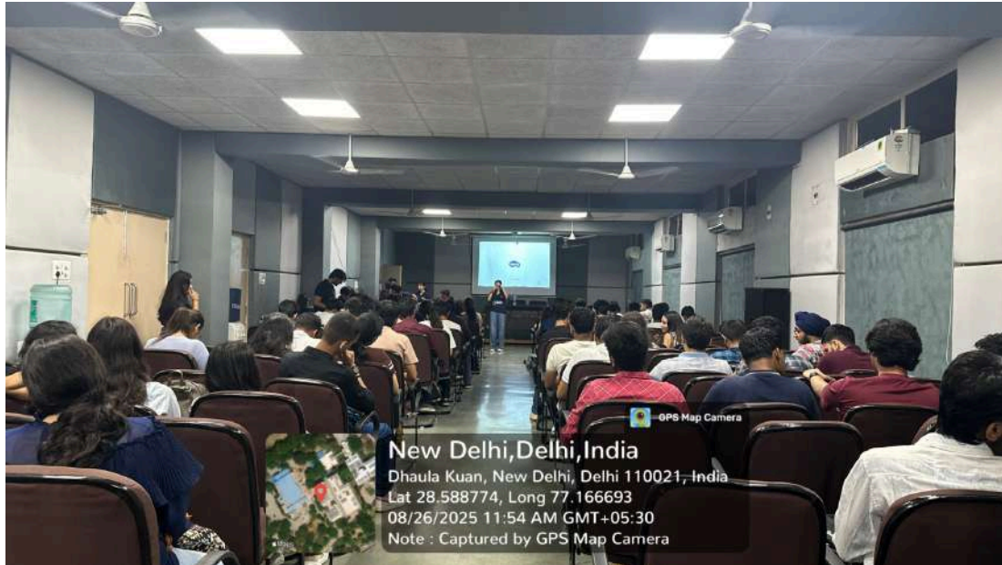
Encouraging participation by a crowd engagement activity.

Encouraging Participation: Attendees, regardless of their academic year, were encouraged to actively engage in Enactus SVC's projects and initiatives.