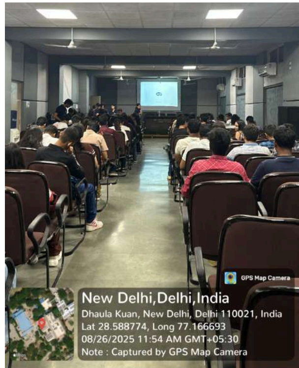
Participants getting introduced to Enactus SVC.